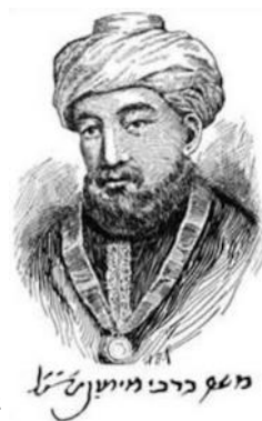
Moses Maimonides, also known as Rabbi Moshe Ben Mimon (the Rambam)

Clearly there is a difference between the defining commands from the Tenach and tradition. Nevertheless, before casting tradition aside, it is wise to consider where it came from, why it was implemented, and to see if it does have relevance for today. As with the drinking of wine, there are many medical traditions that demand reevaluation, particularly with regard to treating pain. Here at Rambam, we are inspired to seek solutions that don't just relieve the pain, but deal with the cause.