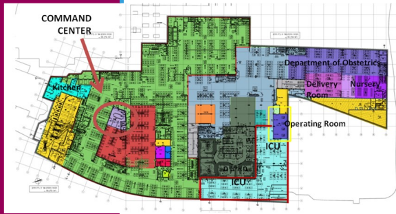
The Fortified Command Center.