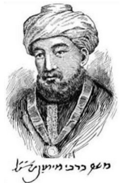
Moses Maimonides, also known as Rabbi Moshe Ben Maimon (the Rambam)

Without a dream and goals for ourselves, we have no chance of achieving them. However, if do have goals, even if we fall a little short of our dreams to always help others, we will still achieve great things as a collaborative body of willing people striving together to advance healing. This is our aim at Rambam Health Care Campus, and by God's grace, may it be so.