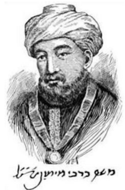
Moses Maimonides, also known as Rabbi Moshe Ben Maimon (the Rambam)