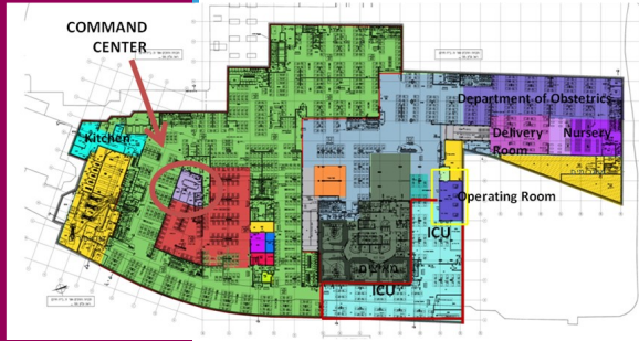
The Fortified Command Center.