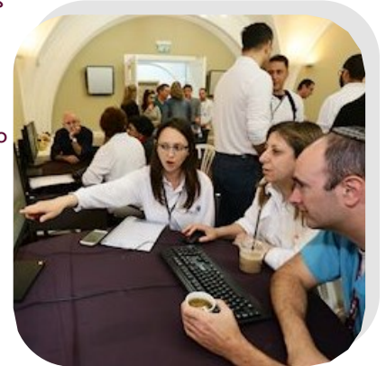
Doctors learn how to use big data in their research.

We deeply value your prayers for our clinician-scientists and your support of our various research programs. In supporting research at Rambam, you become part of Israel's smaller blessings to the world!