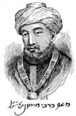
Moses Maimonides, also known as Rabbi Moshe Ben Maimon (the Rambam)