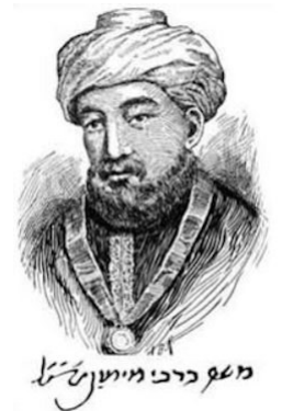
Moses Maimonides, also known as Rabbi Moshe Ben Maimon (the Rambam)

Rambam Health Care Campus and its thousands of staff members are all focused on the business of saving lives; this is our mission, and each one of us contributes in whatever ways we can. In helping others, we fulfill ourselves with one of the highest senses of purpose. My motto includes: more giving is more living. Each member of our multicultural staff collaborates with a single purpose, as if each one is a finger of the larger hand that helps bring healing to those in need.