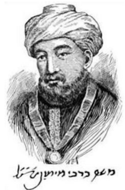
Moses Maimonides, also known as Rabbi Moshe Ben Mimon (the Rambam)