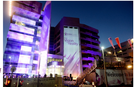
Closing Evening of the 2015 Rambam Summit. On the left is the newly inaugurated Joseph Fishman Oncology Center.

Since you couldn't be here, we hope you enjoy these brief articles to fill you in on what we did, and what we learned.